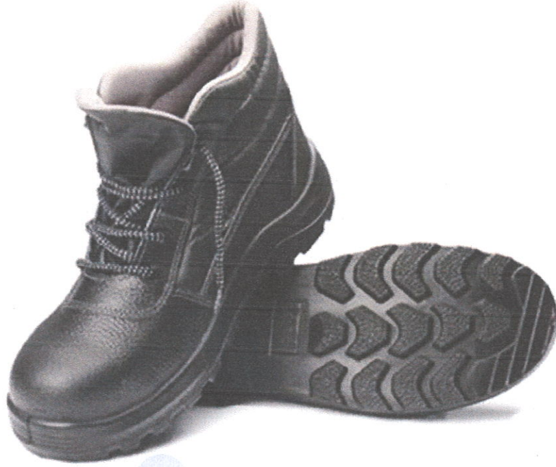
VENTO 571 S2 B